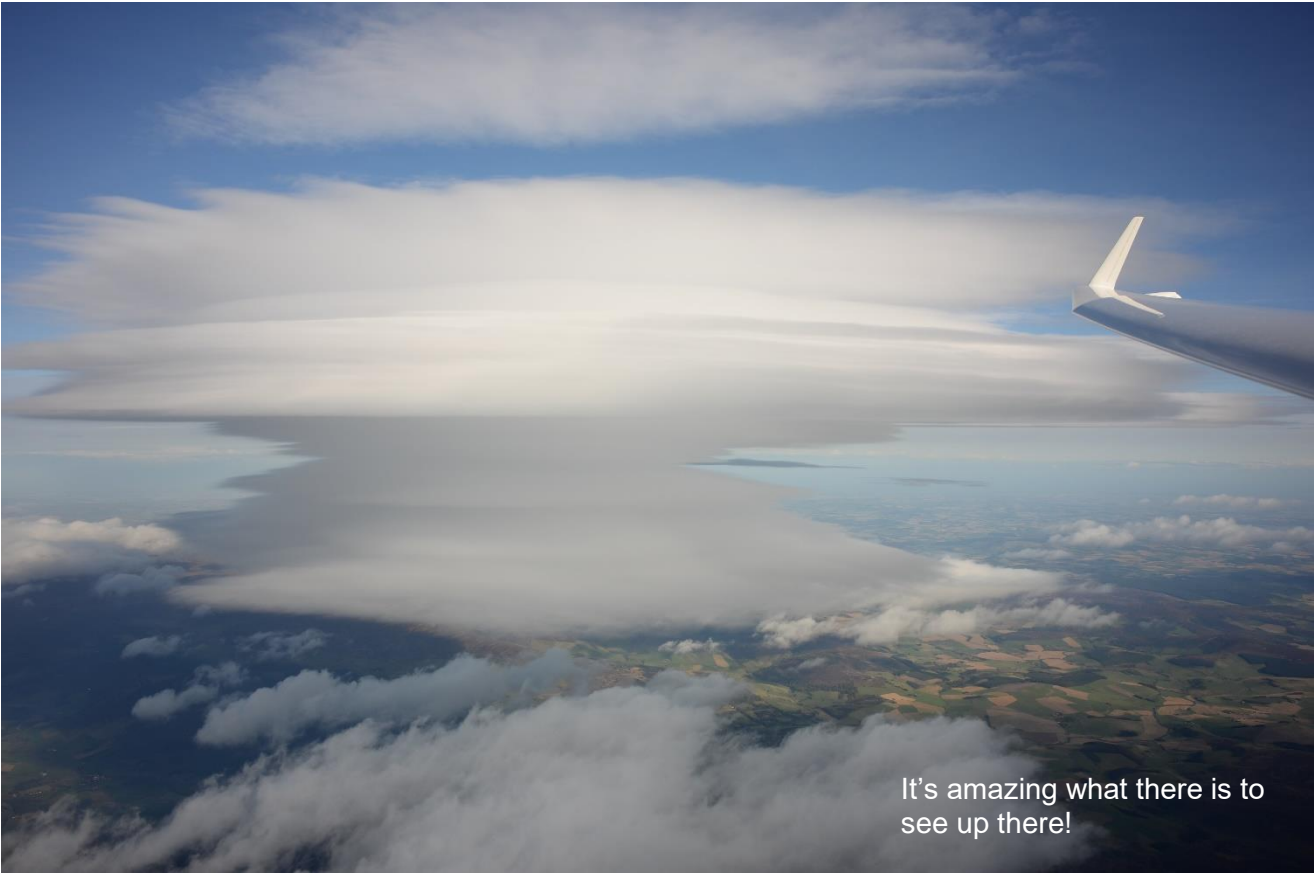
It's amazing what there is to see up there!