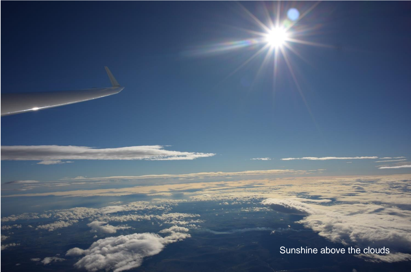
Sunshine above the clouds

Sign up today! Join via the link posted on Whatsapp.