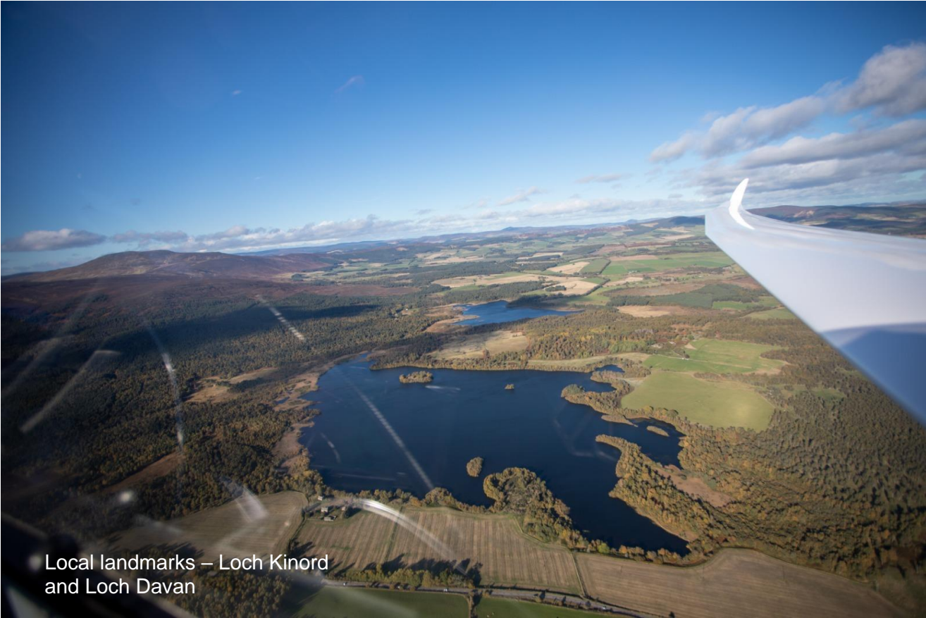
Local landmarks – Loch Kinord and Loch Davan