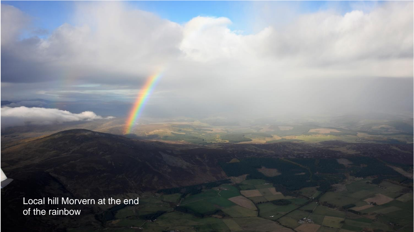
Local hill Morvern at the end of the rainbow