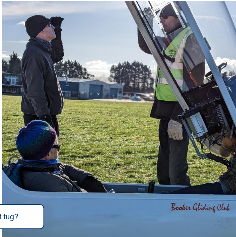
Where's that tug?