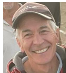
Paul Field Flight Safety