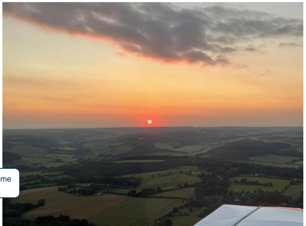
The tug on its way home to Booker