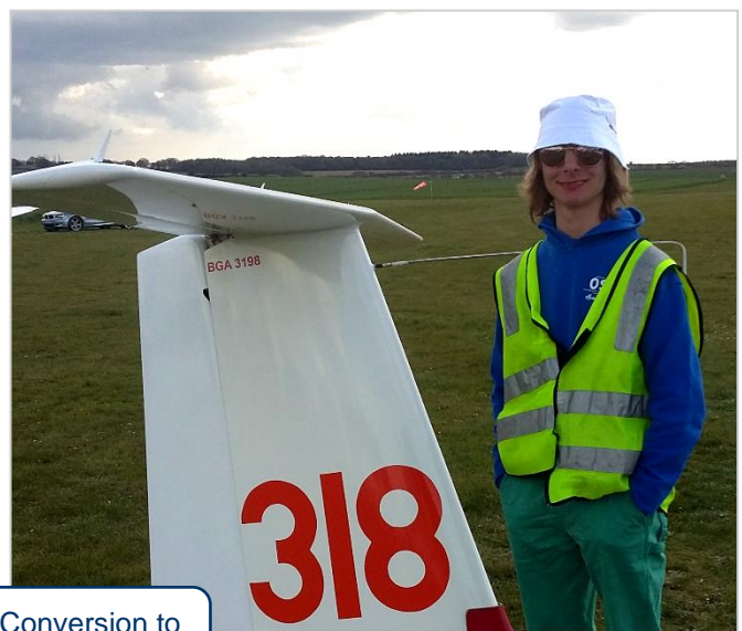
Conversion to Pegase

If a young person came up to me and asked if they should give gliding a go I would always say go for it. You would never look back. It is the perfect after school club which sets you up for the rest of your life. It's the only air sport a young person under 16 can get into and it is also the most affordable with most flights costing £20 (for Junior members) - you can't ask for better. So get down to the airfield and try gliding, you'll never look back.