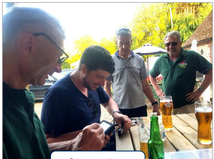
Got to get those traces to the Scorer!