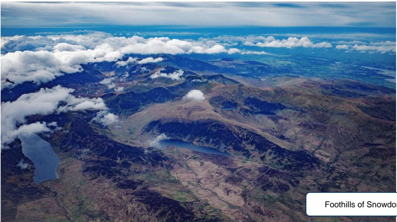
Foothills of Snowdon