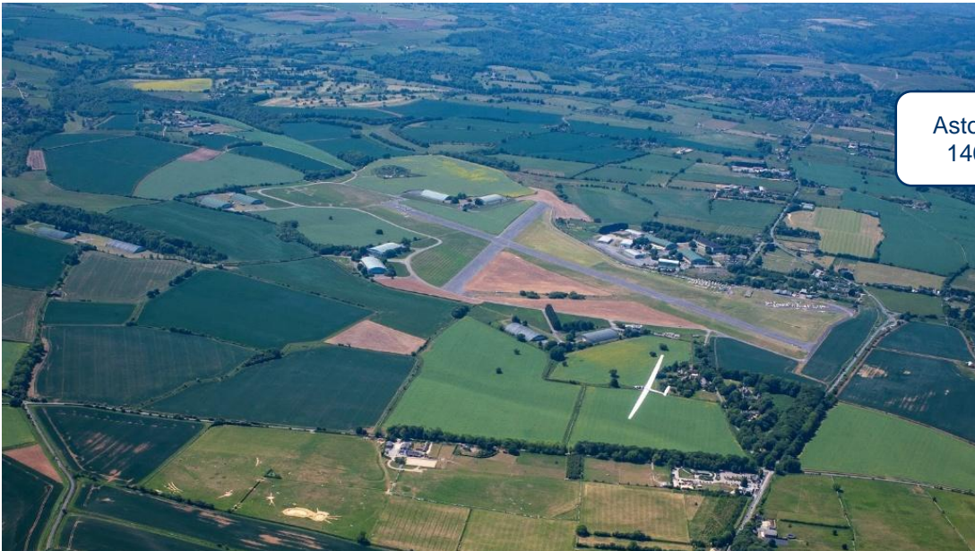
Aston Down airfield 1400m of tarmac