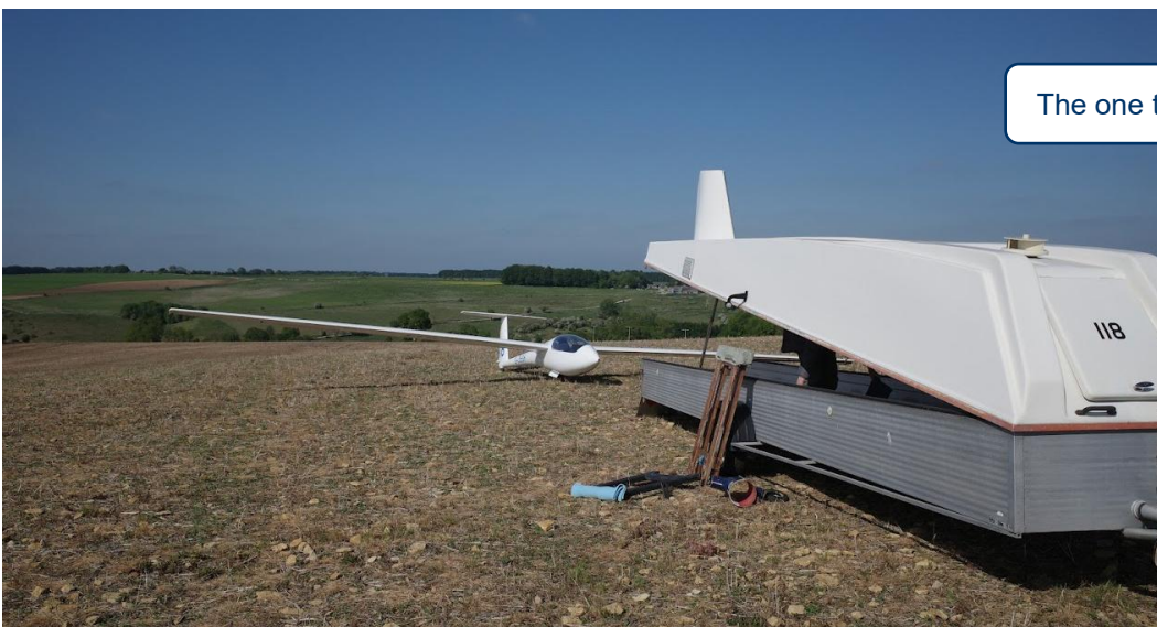
The one that didn't go to plan