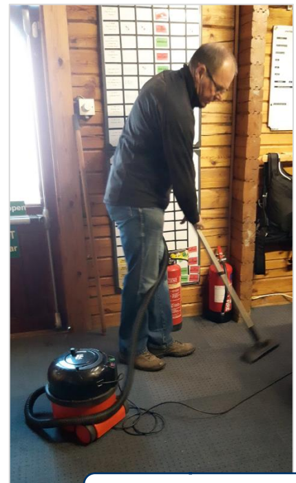
Ace vacuuming in progress

The final task was the blister hangar, which contained an extraordinary selection of junk, up to and including a kitchen sink. This has all been disposed of via multiple trips to the dump and the hangar actually has room for tugs now.