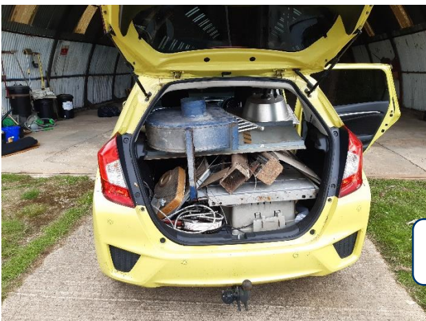
An assortment of metals