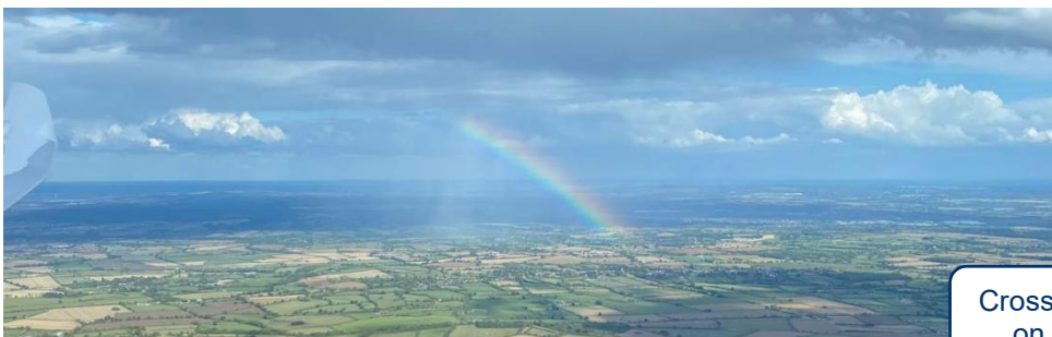
Cross country weather on 9 th September

NOTE: for the rolling recency calculation, the requirement starts on 1 st October but flying in the months before then counts, that is, the clock does not start on 1 st October .